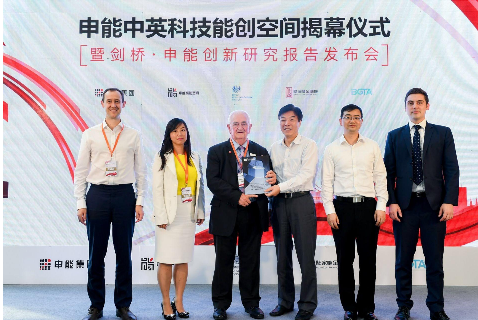
Six Cambridge Innovation Centres and Companies supported the programme 六个剑桥创新中心以及企业支持此项目